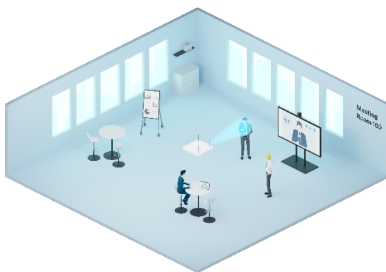
TeamConnect Ceiling 2 focuses on the active speaker

With its 28 condenser capsules that are intelligently linked via DSP matrixing, TeamConnect Ceiling 2 covers the entire room; the signal processing takes place within the microphone housing itself. Dependent on the signal level, the ceiling microphone recognises precisely where the speaker is located in the room and “focuses” on the corresponding area in the form of a beam. Other areas are attenuated accordingly.